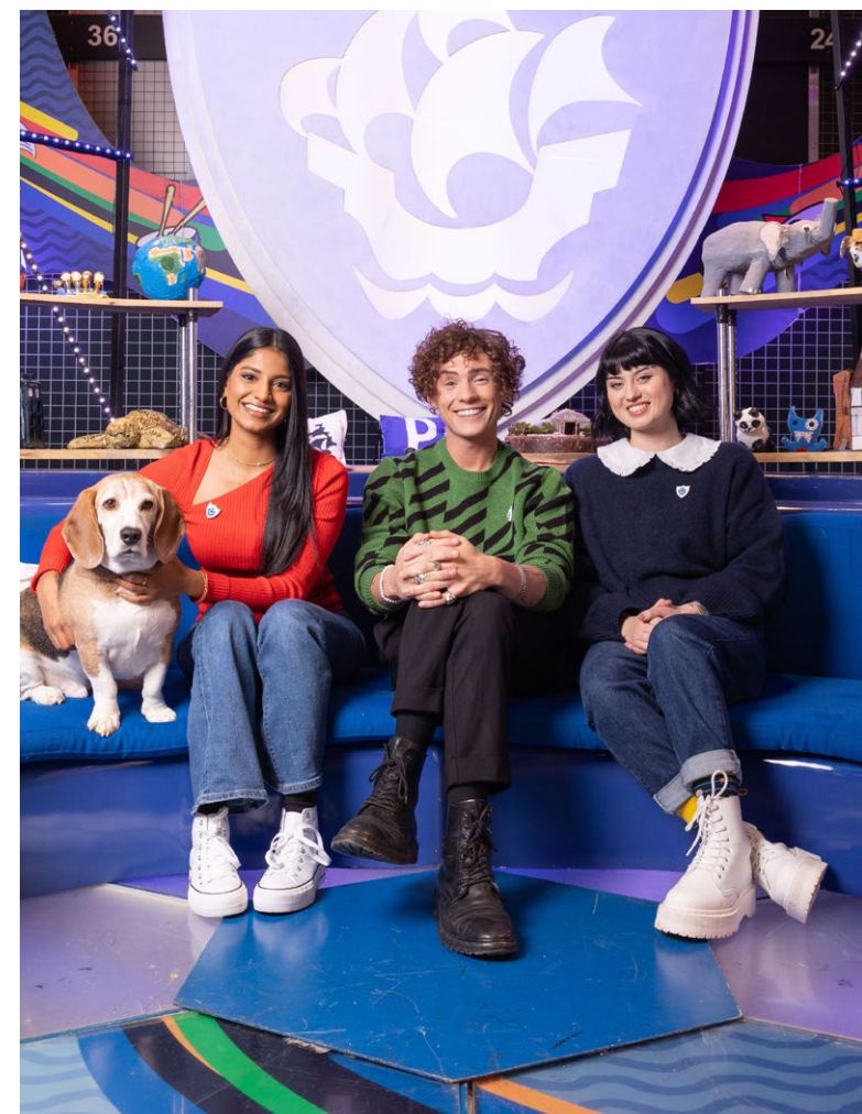
Blue Peter , BBC Studios, CBBC