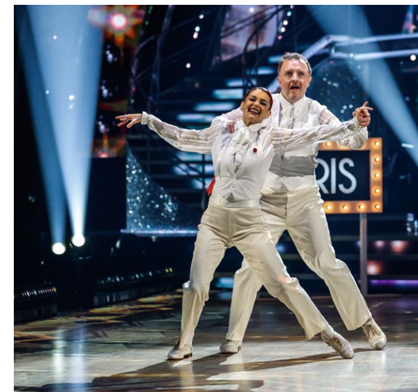
Strictly Come Dancing , BBC Studios, BBC One

In 2023/24, 82% of productions met our 20% diverse production teams target, showing a year-on-year increase across disability, ethnicity and socio-economic diversity captured through End of Production reporting