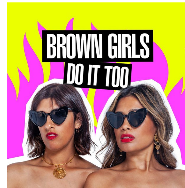
Brown Girls Do It Too , BBC Sounds

In our audio offering, Radio 4's Ability is a sitcom written and performed by disabled actors and comedians which tells the story of Matt who has cerebral palsy. BBC Radio 1Xtra continues to champion Black British culture. The Carnival Family celebrated the unsung heroes of the Notting Hill Carnival.