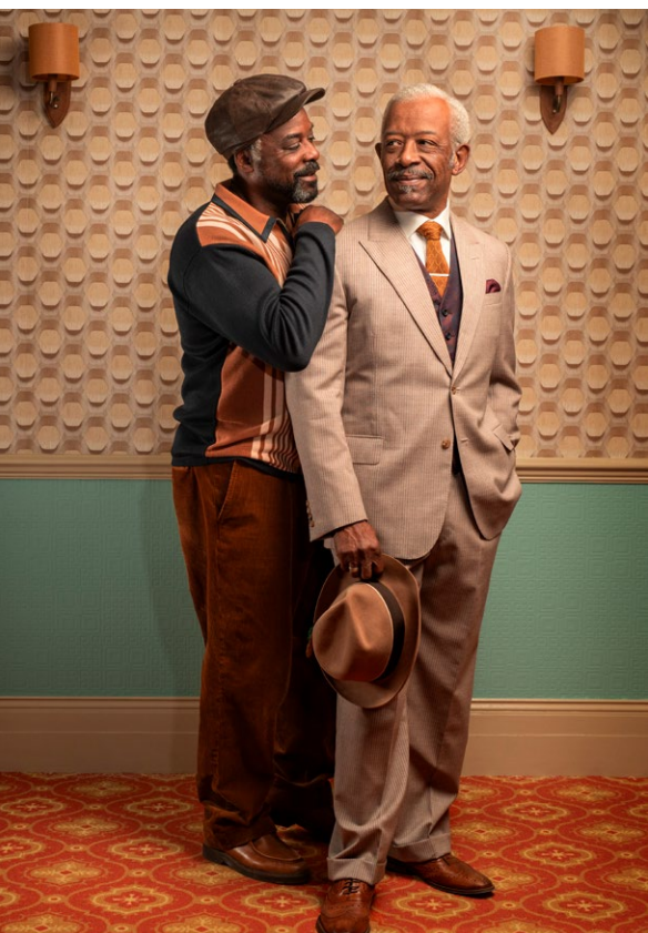
Mr Loverman , Fable Pictures, BBC One