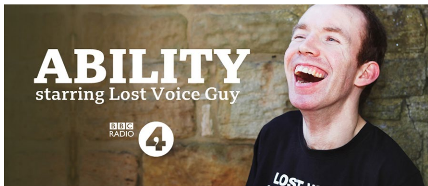
Ability , BBC Radio 4