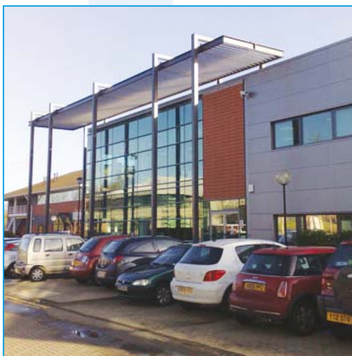
BBC CAMBRIDGE EXTERIOR

Well done to all involved for a smooth job well delivered.