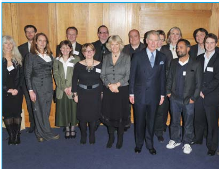
HRH PRINCE CHARLES AND CAMILLA, DUCHESS OF CORNWALL AT BROADCASTING HOUSE, WI

Prince Charles & Camilla, Duchess of Cornwall, were recently welcomed to Broadcasting House by Mark Thompson to help celebrate the 10th Anniversary of the Radio 4 Food & Farming Awards. The FM team at BH worked very hard to ensure that the building was seen in the best possible light by the royal visitors. Well done to all concerned for ensuring that the visit went smoothly.