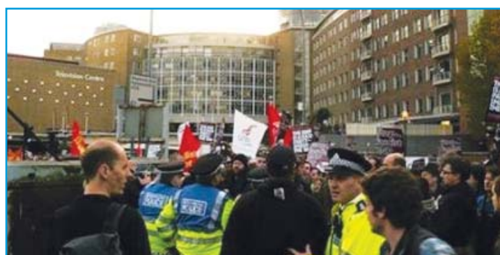
ANTI-BNP PROTESTERS AT TVC

A really big thank you to everyone who was involved in keeping the show on the road at Television Centre in the run up to the broadcast of Question Time with Nick Griffin. It was seen by the DG, Mark Thompson and the Chief Operating Officer, Caroline Thomson as a huge achievement and a major test of our ability to help the BBC keep to its Public Purposes. Despite the attention of 500+ protestors Workplace people worked successfully with other BBC colleagues to ensure the BBC put out four shows from Television Centre including hosting a large number of audience guests. Well done to everyone.