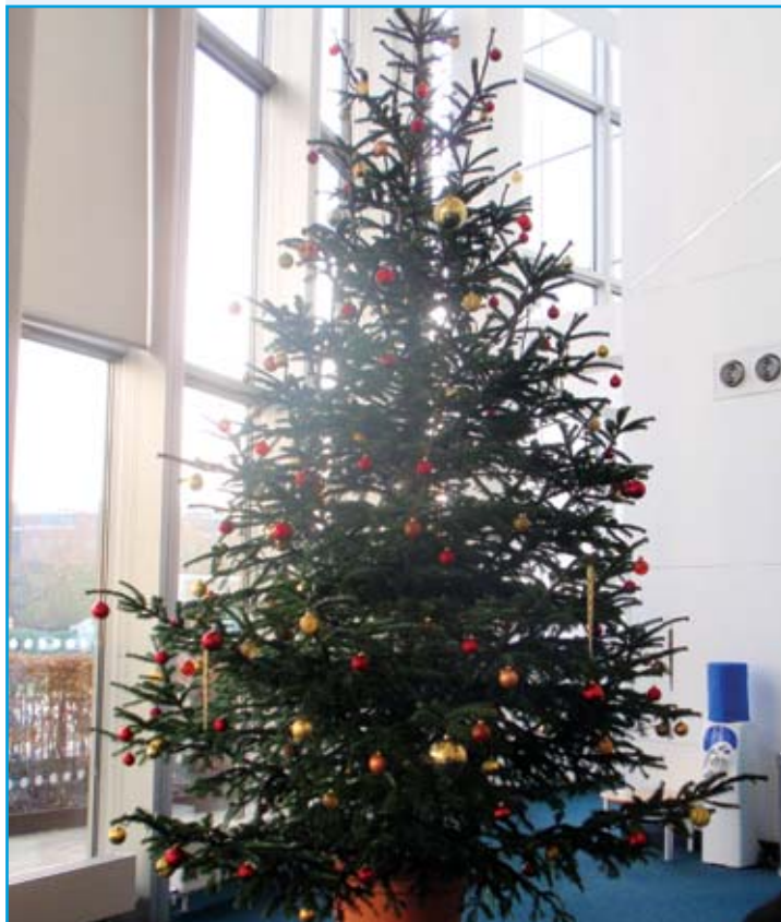
THE WHITE CITY CHRISTMAS TREE

They can be altered to a fixed light so that they can be re-used through the year.