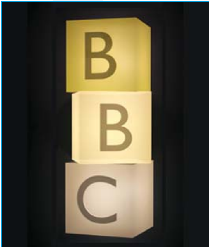
NEW BBC BLOCKS