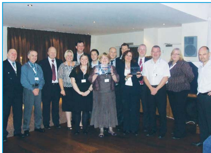
BBW STAFF CELEBRATING THEIR RECENT PFM SUCCESS

These awards are well deserved, external recognition of all the hard work and effort lots of our colleagues are putting in to make proper partnering a reality. Well done to all.