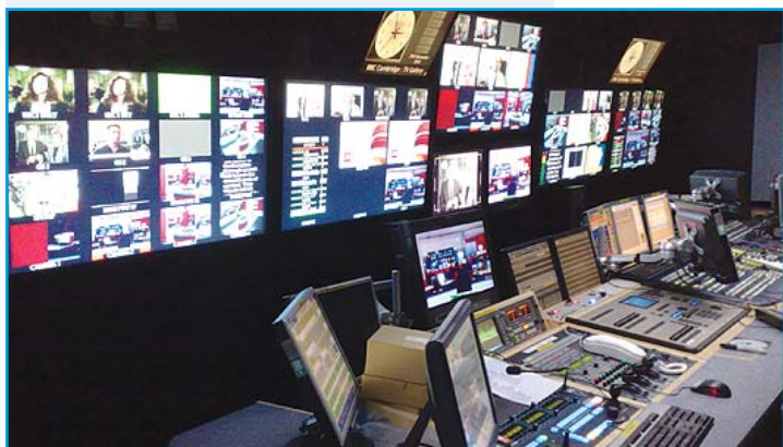
BBC CAMBRIDGE TV GALLERY