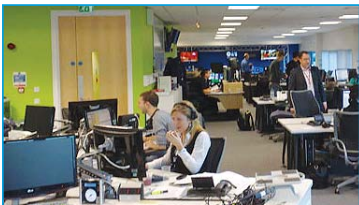
BBC CAMBRIDGE NEWSROOM