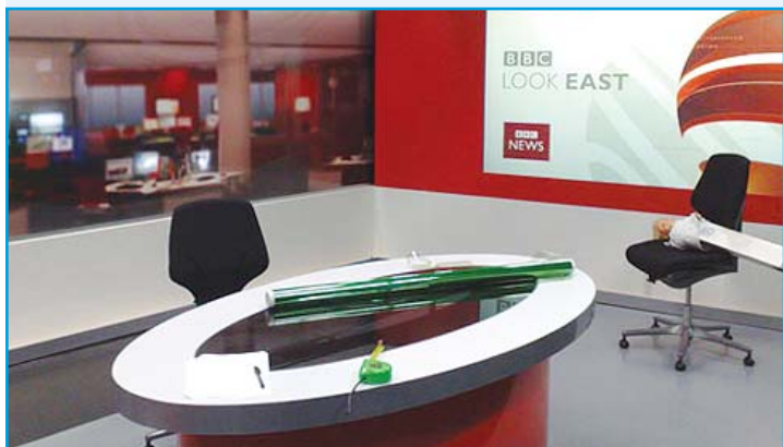
BBC CAMBRIDGE TV STUDIO