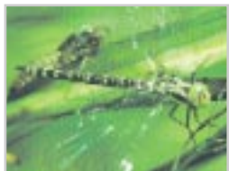
Dragonfly ( Odonata )

Disused railways & canals provide an ideal corridor for wildlife to move around the urban area: