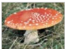
Fly agaric ( Amanita muscaria )