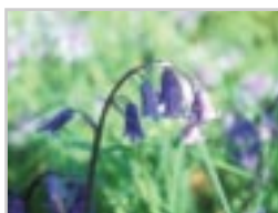
Bluebell ( Hyacinthoides non-scripta )