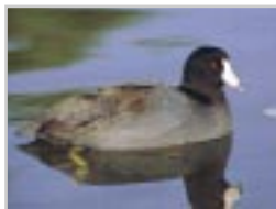
Coot ( Parus caeruleus )